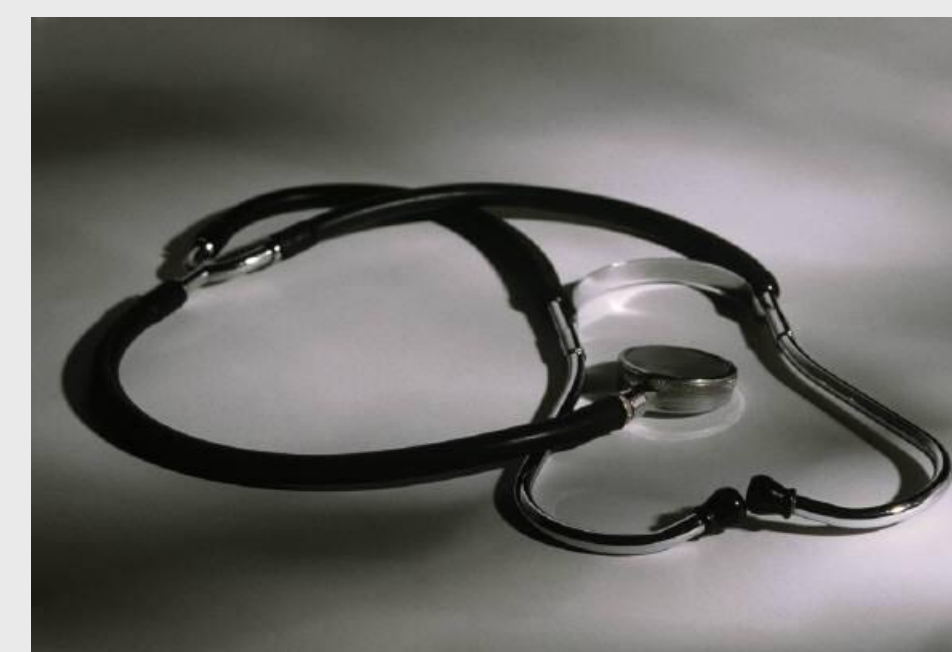
Figure 1. Label in 20pt Arial.

1. Click here to insert your References. Type it in or copy and paste from