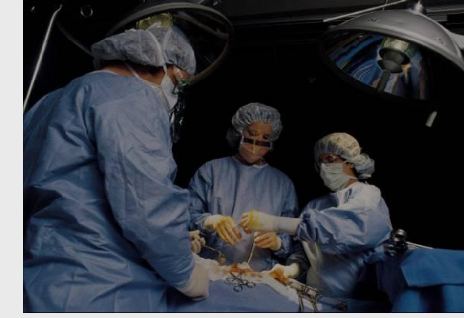
Figure 2. Label in 20pt Arial.